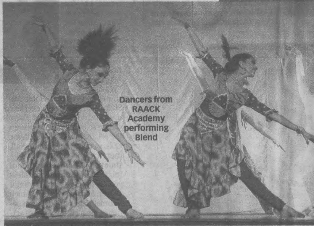
Dancers from RAACK Academy performing Blend

Commencing the programme with a brusque number, Blend , choreographed by Ramash, the dancers next went on to per-